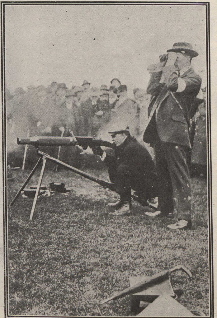
Firing the Aerial Gun from a Tripod Field Mount.

This is the Second All-oil Battleship of the British Navy to Take Water. At Devonport Recently Winston Churchill Benevolently Permitted Mrs. Austen Chamberlain, Wife of a Political Opponent, to Christen This Monster of Eight 15-inch Guns, Carrying the Largest Weapons of Any Warship Afloat.