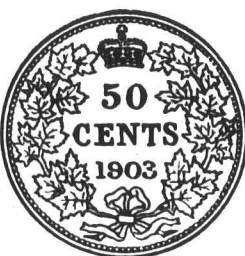
Stamped Coin, showing exact value

You know the value of a piece of gold or silver by its stamp or brand—the stamp is the government's guarantee of its worth; without the stamp you would doubt its value, and would not accept it.