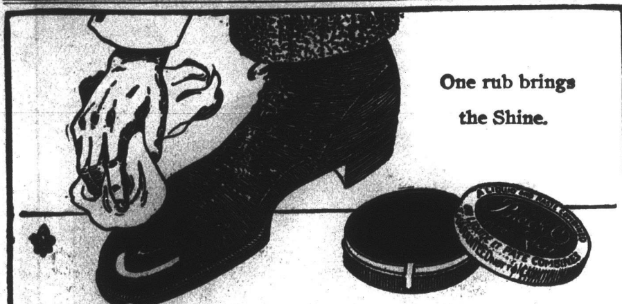
One rub brings the Shine.

That's what you want—a quick shine. No time to wait in shine parlors—no energy to waste on perspiration-bringing polishes. Black "O" is paste and liquid combined. Dab a very little Black "O" on your shoe, brush it off with a cloth, and you have a brilliant, black shine in two minutes time and no labor. Black "O" will not injure the leather—are you sure the polish you use now doesn't?