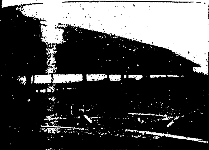
THE SORTING SHED.