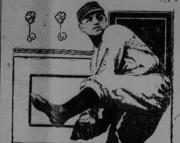
JOE MCGINNITY, THE ONE-TIME INVINCIBLE.

There have been many number of so-called "Iron Men" in base ball, but Joe McGinnity is the best known of them all. McGinnity had a habit of pitching double-headers and winning them in a manner that made it look easy. It now appears that McGinnity's day as an effective pitcher is over. The old-time star is part owner of the Newark club of the Eastern league, and the going hasn't been easy for him for some time, but an accident to his pitching arm several days ago probably has put him out of the pitching end of the game for good. Of course, the Newark fans are worried, because McGinnity was one of the club's mainstays in the box. McGinnity made his greatest record as a member of the New York Giants in 1905, when they won the pennant in the National league and then toyed with the Athletics, coping the title of world's champions. In this season McGinnity pitched 46 games, and his percentage of victories was .583. In