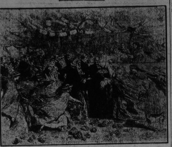
Queen Alexandria arriving in England, May 7, 1863. She received a bouquet of flowers from the Mayor of Gravesend.

Specialties and Eyeglasses; all styles and descriptions, perfectly adjusted by D. BOYANER, Scientific Optician, 88 Dock street. The only scientific optical store in the city.