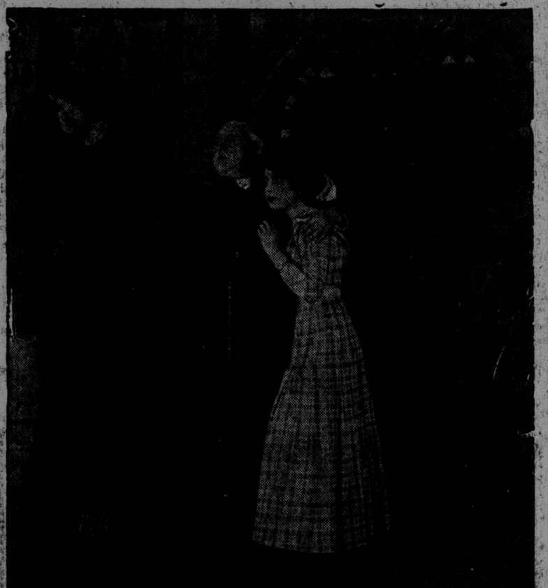
A scene from "The Rosary," to be presented by Partello Stock Company at the Opera House, Monday, Tuesday and Wednesday of the coming week.

In the good old days gone by where a gardener was kept it used to be the custom to keep a cask of lemonade from which the outdoor servants could help themselves. The gardener was noticed to go very frequently to the cask, and his mistress took occasion to speak to him on the subject. "John," she said, "I think you get thirsty very often." "No, mum, I don't," replied John. "Well, John, I see you very frequently at the lemonade barrel." "Yes, mum, that's what keeps me from getting thirsty." Already 800 miles of the 1,000 miles of railway across Australia, recommended by Lord Kitchener during his visit to the commonwealth, for strategic purposes, has been built, and it is expected that the line will be finished by the end of 1916.