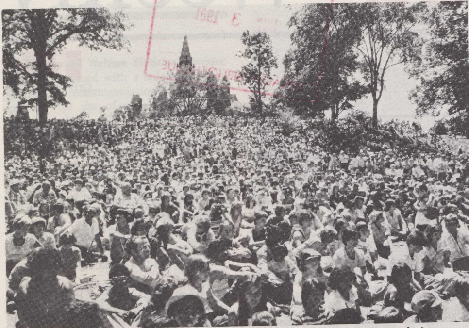
Census figures for 1981 are expected to show a 5.9 per cent growth in population.