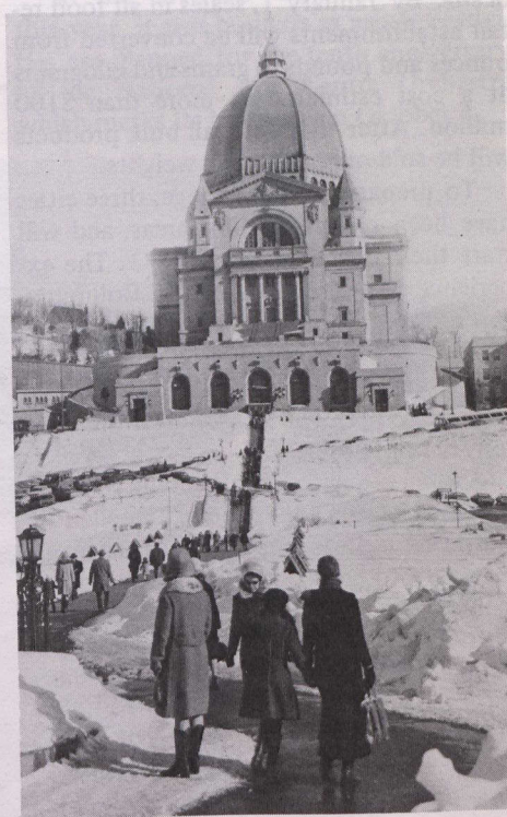
The Oratory attracts some two million visitors and pilgrims a year.

Brother André was pronounced "venerable" by Pope Paul VI in 1978, meaning that the Roman Catholic church considers him to be an exemplar to the faithful.