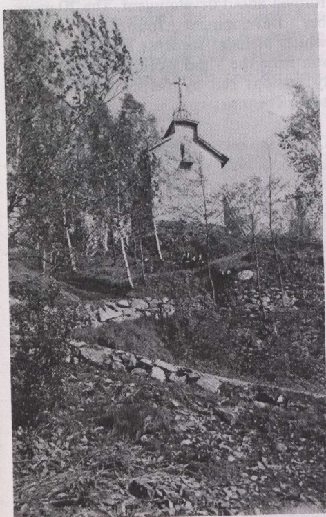
St. Joseph's Oratory as it was the day of its inauguration, October 19, 1904.