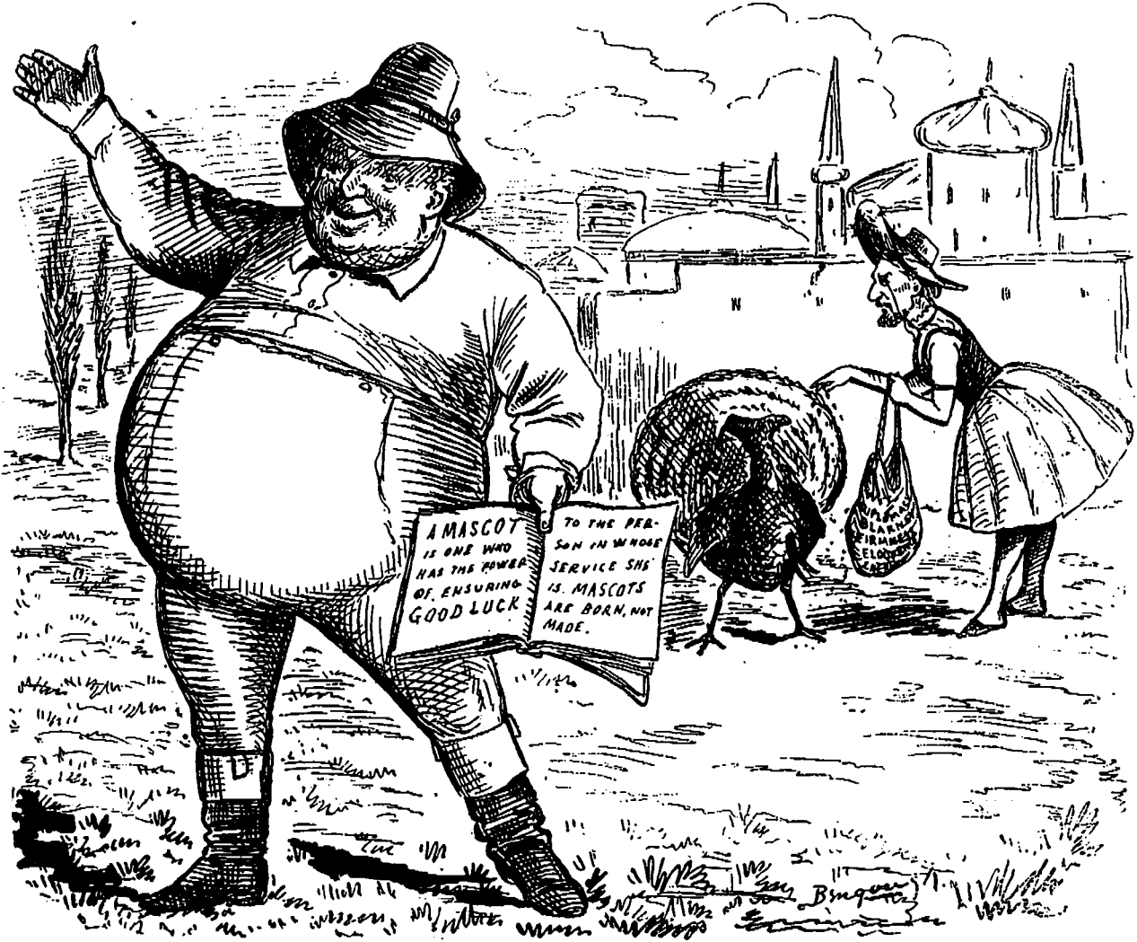
JOHN BULL HAS GOT A MASCOT! OR, THE GIRL WHO KNOWS HOW TO MANAGE THE TURKEY.

VOLUME IX. No. 15 TORONTO, SATURDAY, SEPT. 2, 1882. $2 PER ANNUM 5 CENTS EACH