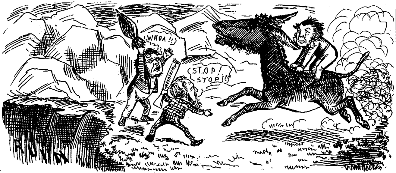
IN VAIN! IN VAIN!!

"The very dimples of his chin and cheek, His smile, the very mould and frame of hand And nail, and finger."