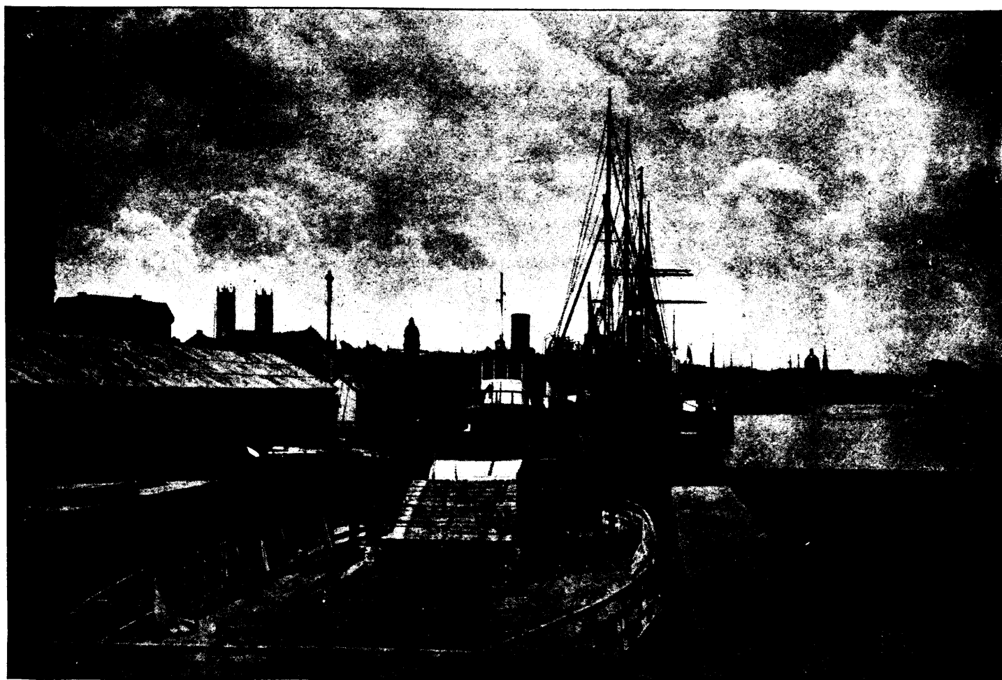
“EVOLUTION,” A VIEW IN MONTREAL HARBOUR.