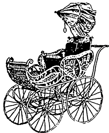
No. 1007. $13.00 each.

have not been enterprising enough to secure a supply of these fine specialties for themselves. The H. A. Nelson & Sons Co's. line has its own just and fair proportion of these fine goods. Dolls, toys, fine fancy leather, celluloid, and fancy papier mache, and decorated paper goods, glass and china-