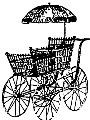
No. 1000. $5 50 each.

The H. A. Nelson & Sons Co., Limited, have all travelers now on the road booking orders for immediate and Spring delivery. Their import samples are now ready and travelers will shortly call upon the trade. Their line this year is more replete than ever, being even more varied, and larger than their enormous line of 1899. Every