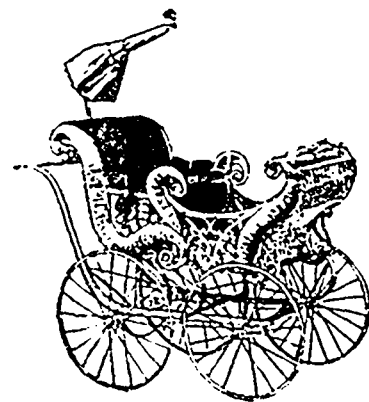
No. 1011. $19.50 each.

ware, novelties in all lines are in this import line, and the wise merchant will not wait in vain if he reserves his order for their traveler. If their representative has never called upon you with his import line, drop them a card and they will see that your request is complied with.