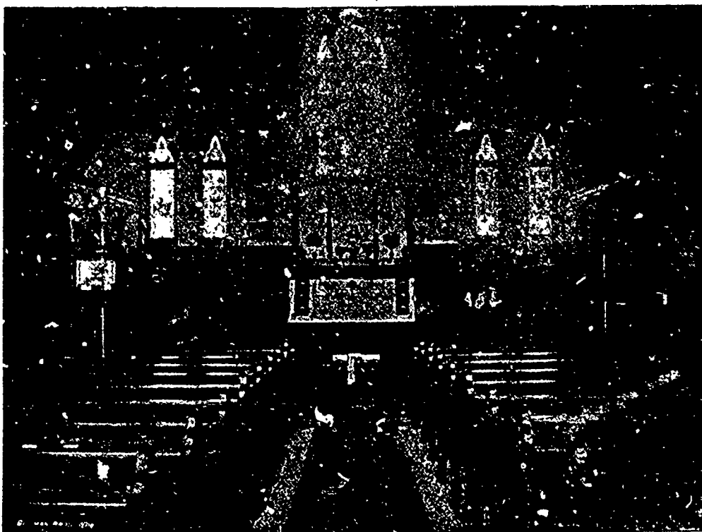
ST. PAUL'S, REGINA, INTERIOR.

on your space; but recollections and reminiscences crowd upon the mind, and, in bringing the recital of them to a close, may it be with the prayer that the good work in progress receive no check, that the band of faithful