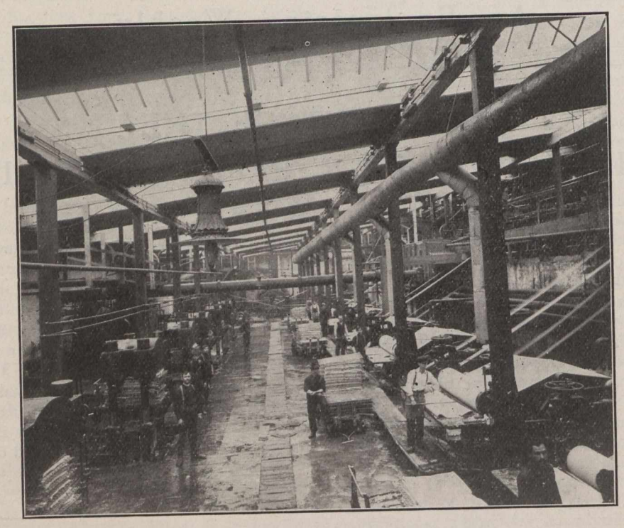
Pulp Mill, Showing Hydraulic Presses at Work.

similar in capacity, which are used for pumping the ground woodpulp from the pulp mill on the lower level to the paper mill above. A booster pump is contained in the pumping station, electrically driven, which will be used for fire protection, and there is also a steam pump, to