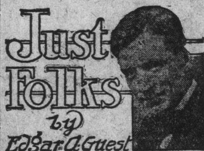
Edgar A. Guest