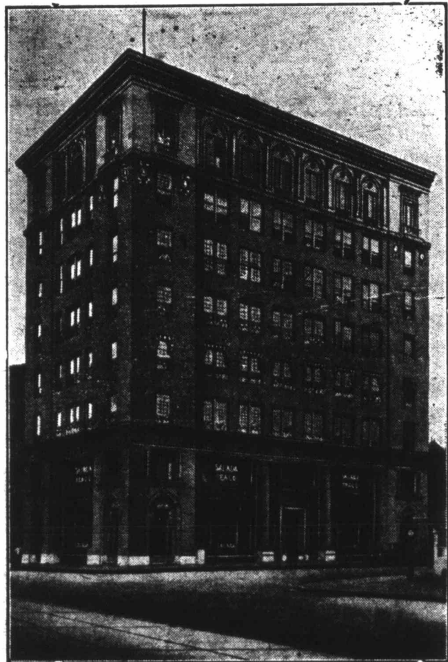
SALADA BUILDING, BOSTON

Besides, these buildings in Toronto, Montreal and Boston, other Salada Offices are situated in Winnipeg, New York, Chicago, Detroit, Buffalo, Pittsburgh, Philadelphia, Los Angeles, San Francisco, and London, Eng. The Company trades only in tea and only in tea of Salada quality, thus assuring undivided attention to the product. Every package of Salada, wherever bought may be relied upon to be of exactly the same fine quality and to yield an unequalled cup of tea. This policy of keeping faith with the public has been responsible for Salada's extraordinary sale.