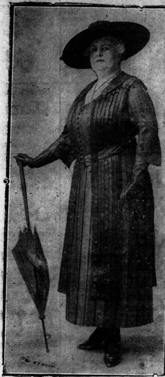
ATTRACTIVE SVELTLINE GOWN The woman of matronly figure will appreciate the long, well-proportioned lines of this most attractive sveltline gown. Note the straight-hanging plaits in the skirt and over-drapery, as well as the cleverly cut sleeves and collar.