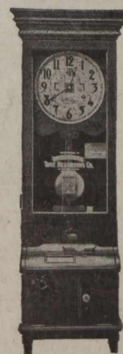
International Card Time Recorder

Also manufacturers of Dayton Scales and Hollerith Electric Tabulators.