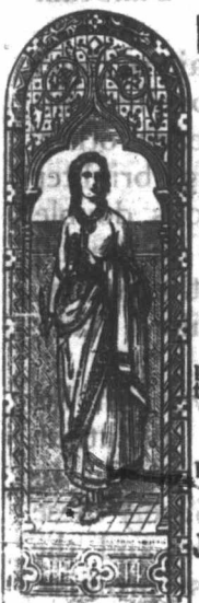
FIGURE and Ornamental MEMORIAL WINDOWS AND GENERAL Church Glass.

Art Stained Glass For Dwellings and Public Buildings