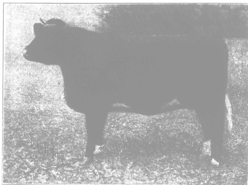
Spring Grove Butterfly = 88602 =