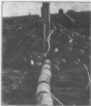
Ventilation for the Root Pit

Ventilation is next attended to and this is one of the most important points in pitting roots. As seen in the illustration, Mr. Brethen's method of ensuring ventilation, is to lay five-inch tile along the bottom of pit and directly in centre; an inch of space is allowed between each tile. Every 30 or 25 feet a small stake about five feet long is driven into the soil between two of the five-inch tiles and four inch tile are dropped down around the stake, thus giving a cheap and easily constructed ventilating chimney.