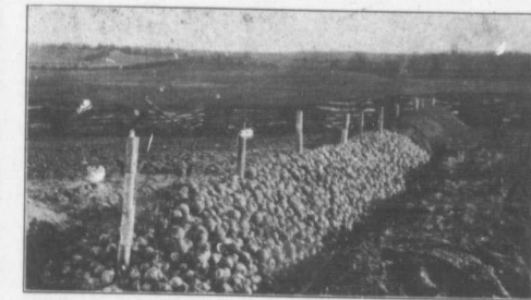
A Method of Pitting Roots that has Proven Itself Satisfactory

The harvesting methods followed by this same farmer are also interesting and represent a minimum of work. The tops of the turnips are first chopped off with a sharp hoe, a good active man being able to cut tops from a row almost as fast as he can walk down it. The turnips are then pulled by means of a drag harrow minus the teeth.