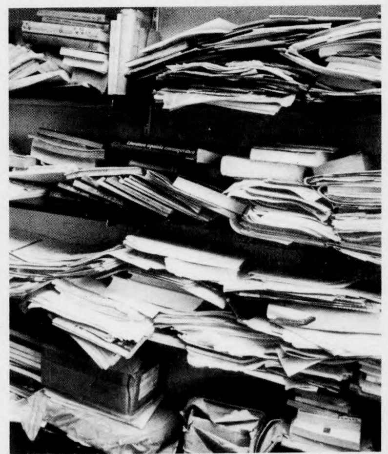
NO RESPITE FOR THE LONELY SCHOLAR...Excal's version of a "Do Not Disturb" sign. Cut and paste on your local bathroom cubicle. Sit calmly and persevere until spring.