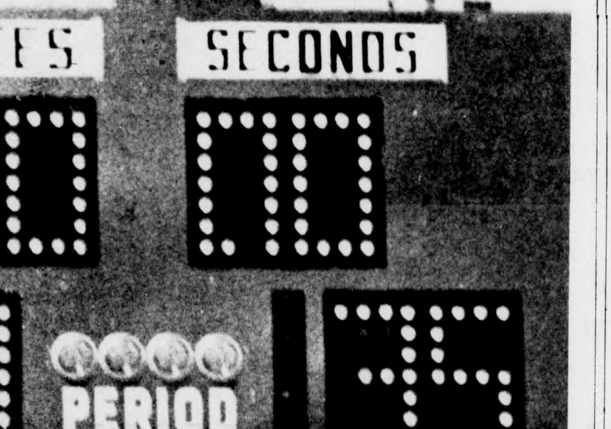
Yes Virginia, it's legit.