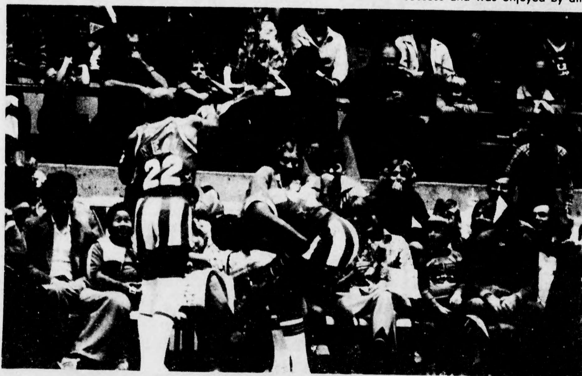
Whoops - missed

The Harlem Globetrotters entertained an almost sellout crowd at the Aitken Centre Monday. Although their game has become predictable, the Globetrotters can still make people laugh no matter how often you've seen them.