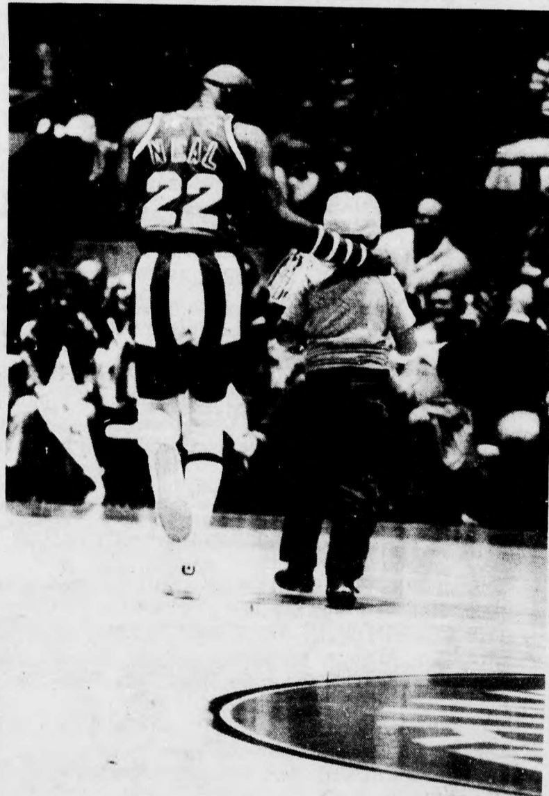
That's all folks