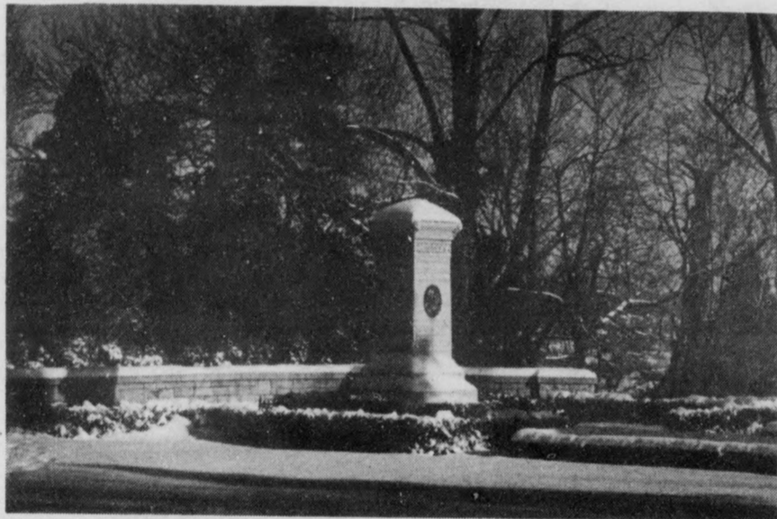
MONUMENT TO LAURA SECORD