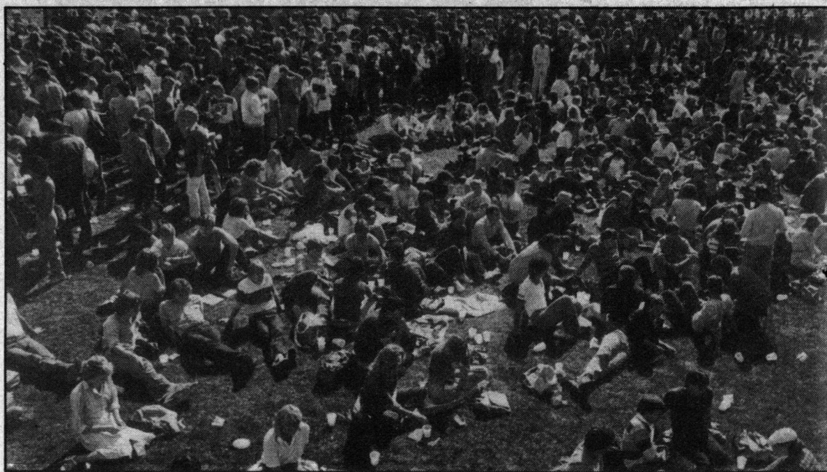
It was standing room only at the beer gardens whenever the sun shone.