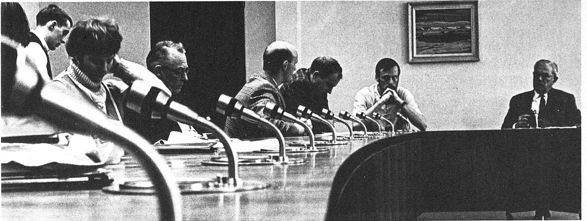
The first (and last) meeting of the Joint Committee on Student Relations

.. The Gateway saw it happen—read page five.