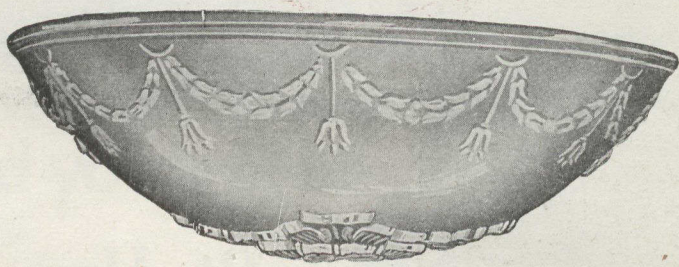
No. 6024. Semi-Indirect Unit

It is the modern way of lighting a house—infinitely more beautiful than the old, and cheaper. MOONSTONE glass so multiplies the light that it is not necessary to use so many high-power lamps.