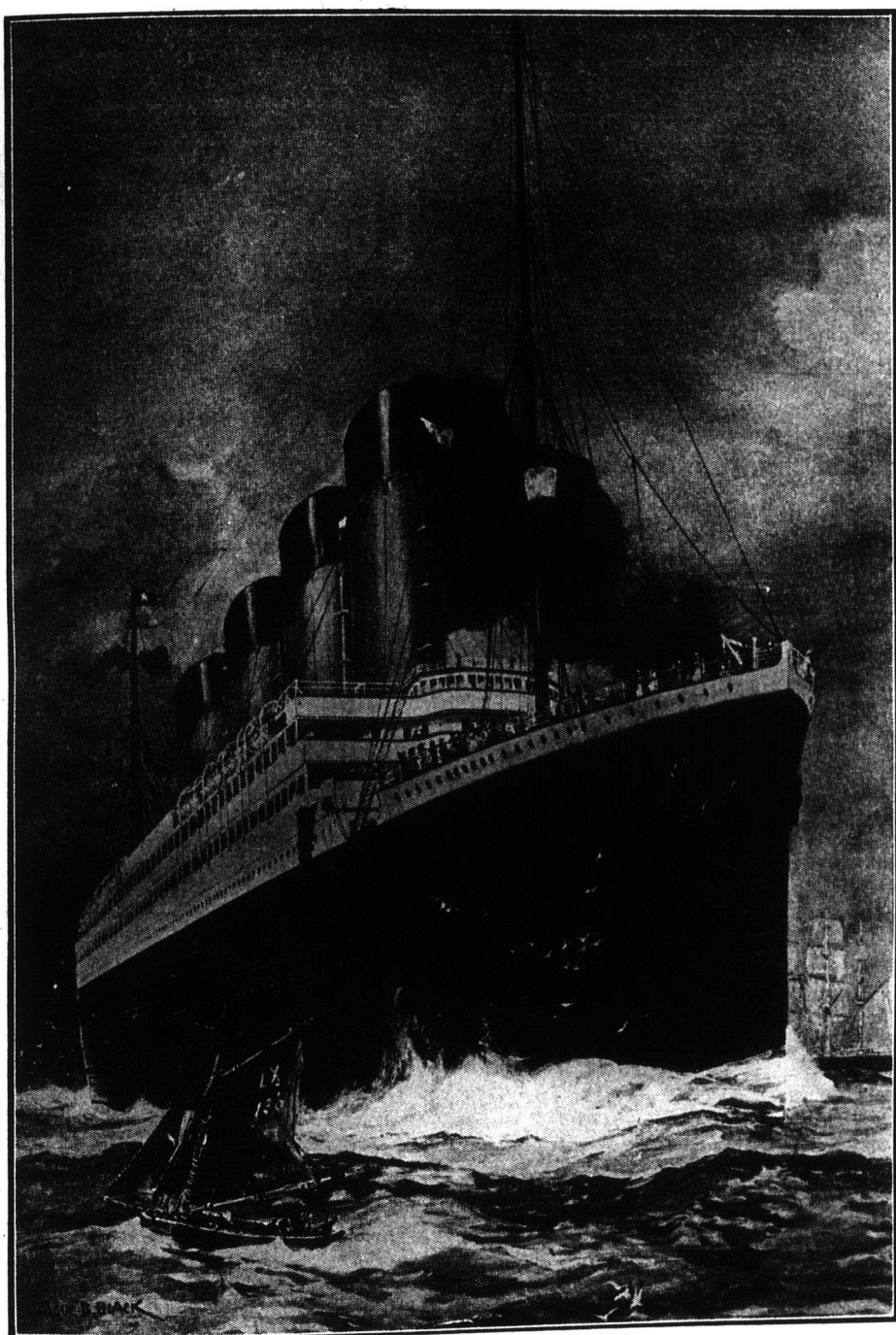
The largest steamship afloat recently launched at Belfast. "Olympic" White Star Line.

"The home is not only the seed plot of a nation's continued existence, but it is the spring from which proceeds all that is essential to the true patriotism of a people, to the real power of any community, and to the sustained in-