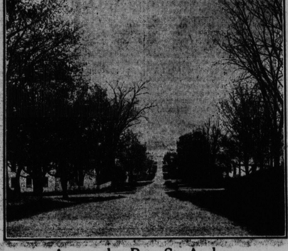
Across the Bay, St. Andrew

They are also distributors of BEAVER BOARD and RUBBEROID ROOFING and carry a large stock of Plate and Sheet Glass.