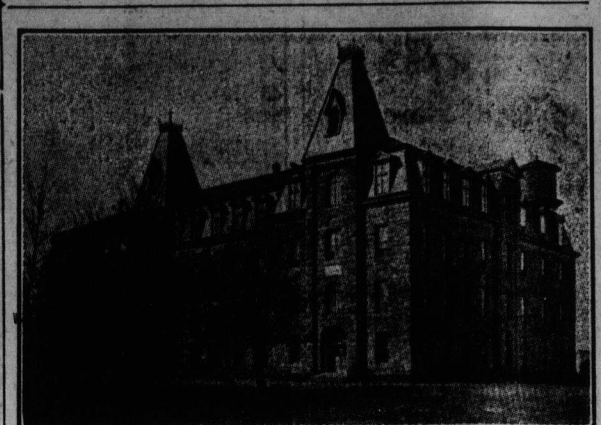
St. Joseph's College

A Brief Sketch of Its History and a Recital of the Work Which is Being Carried On in That Institution—A Credit to the Province.