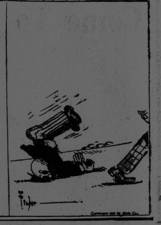
EDDIE GRANT'S FAMOUS HANDS