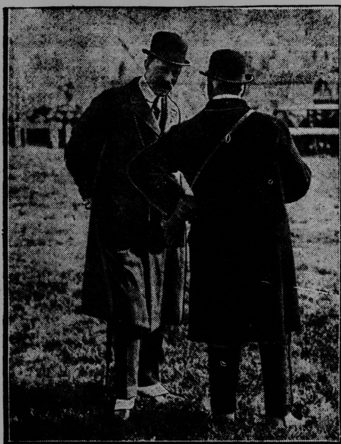
Lord Lascelles at the races. A photograph taken on the course at Epsom.