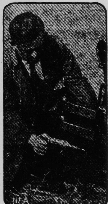
Grease the chassis, transmission and differential