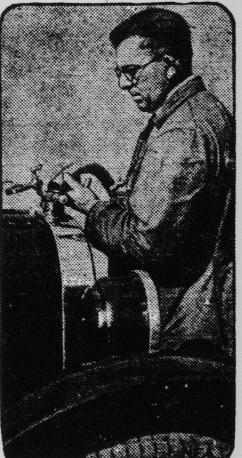
Flush the radiator clean of rust and sediment