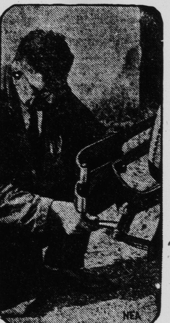
Tighten the body bolts and chassis bolts