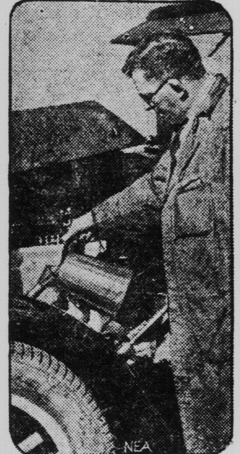
Drain the crankcase and refill with lighter oil

Equality Claim From South Africa Causes Some Division