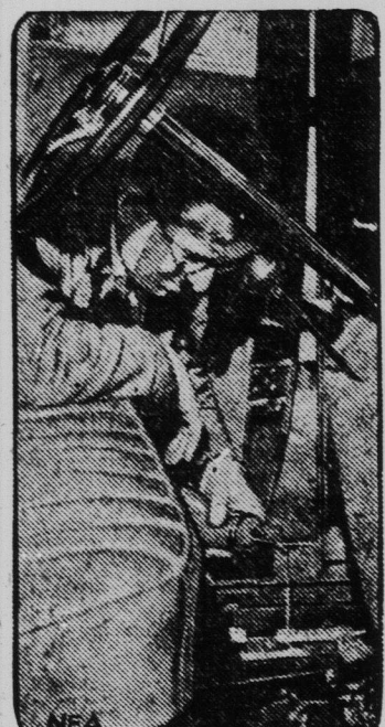
Fill the storage battery and keep fully charged

THE EVENING TIMES-STAR, SAINT JOHN, N. B., WEDNESDAY, NOVEMBER 3, 1926