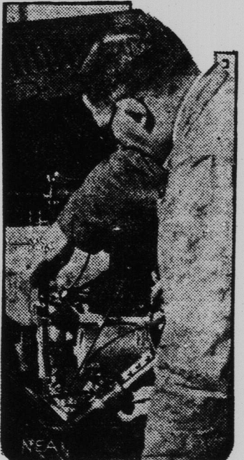
Adjust the carburetor for heavier fuel mixture