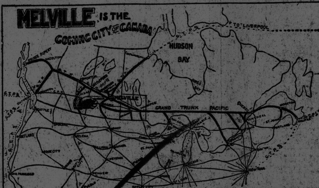
Melville, Sask., is the Chief Division Point on the Grand Trunk Pacific West of Winnipeg.