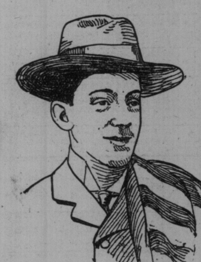
KING ALFONSO. Madrid, May 18.—An Anarchist plot against King Alfonso has been discovered.

Nine Dynamite Cartridges Seized and a Dozen Arrested in Madrid.