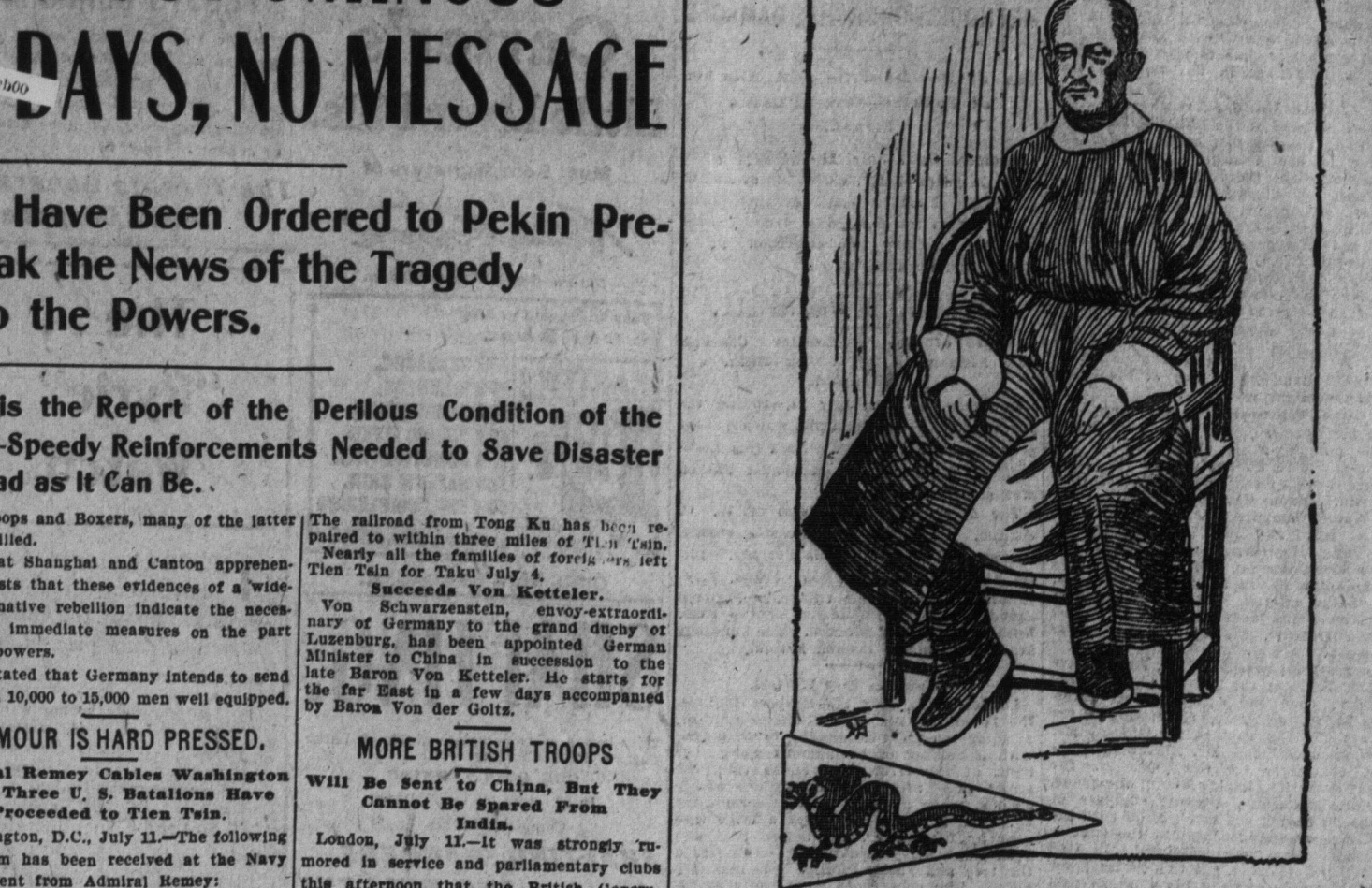
Who is reported to have made an effort to aid the Foreigners in Peking, who are now beleaguered to have met an awful fate. Ching was formerly President of the Tsung Li Yamen.