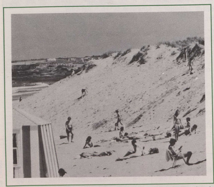
Red sandstone cliffs and dunes distinguish the beautiful beaches in Prince Edward Island National Park.