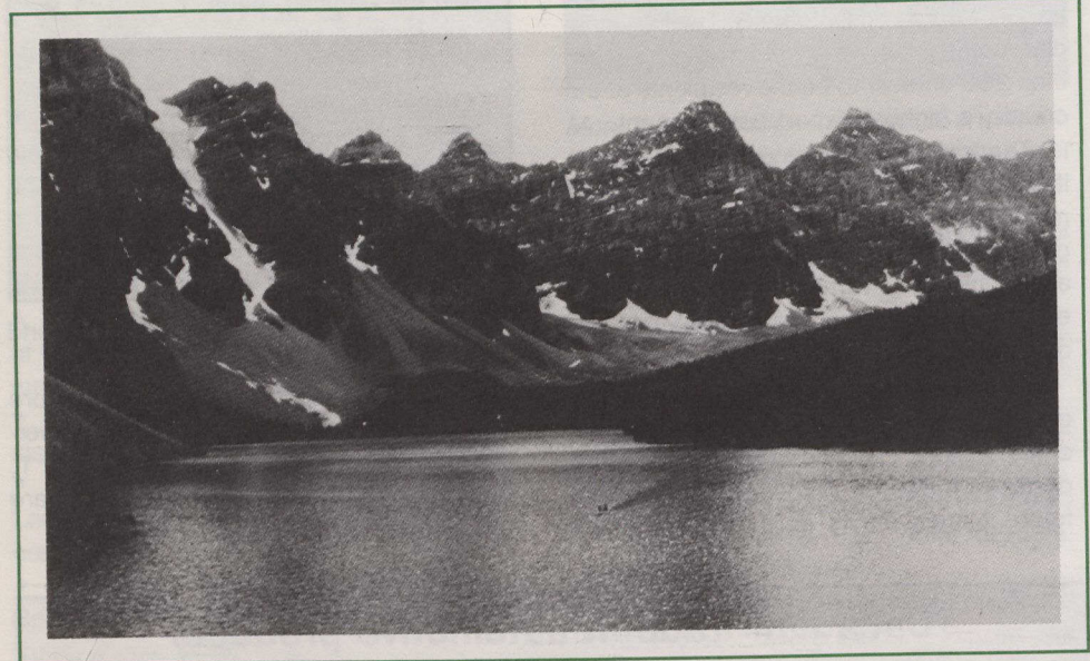
The mountain peaks towering above Moraine Lake in Banff National Park are one of Canada's best-known vistas. The view appears on the reverse of the country's $20 bills and is featured on the $2 definitive stamp issued by Canada Post to mark the Banff centennial.

All of Canada's national parks are managed by Parks Canada. Numerous volunteers assist in many of the programs which