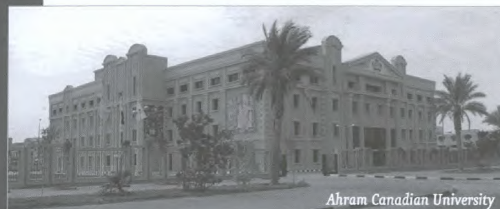
Ahrm Canadian University

It's no surprise that opportunities for Canadian providers of education services are huge when the average Egyptian family spends around 40% of its income on education, and the country ranks first in the Middle East when it comes to student enrolment.