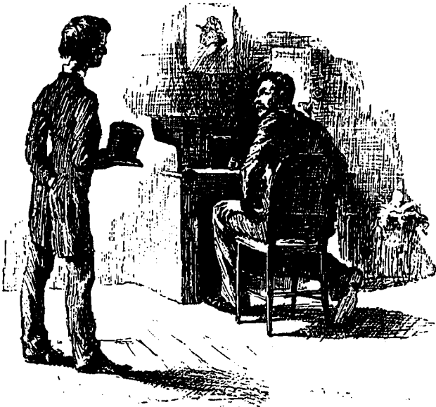
ALLEGED TRAGEDIAN: I have come again; I thought, perchance, there might be an opening.