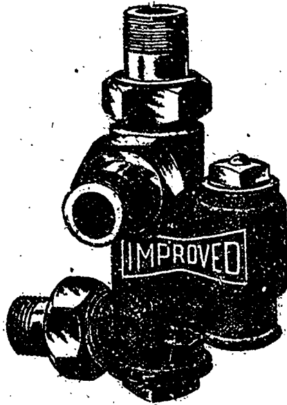
IMPROVED T. J. C. INJECTOR No. 2.