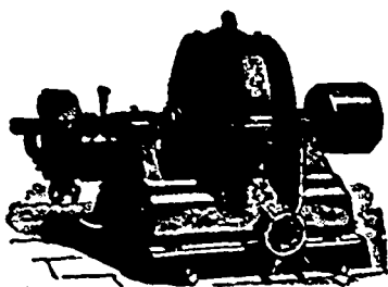
500 LIGHT ALTERNATOR.