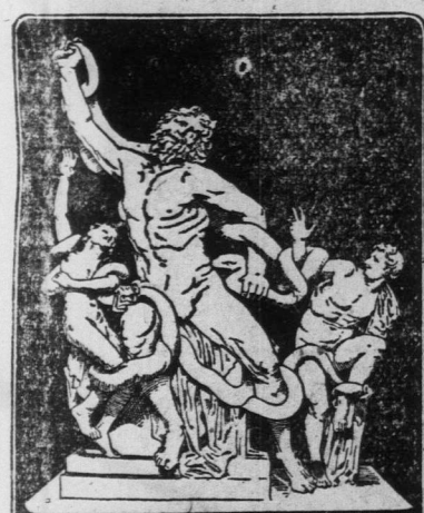
Famous Greek Statues--THE LAOCOON GROUP.

The C. L. MARCH Co., Ltd., Corner Springdale and Water Streets.