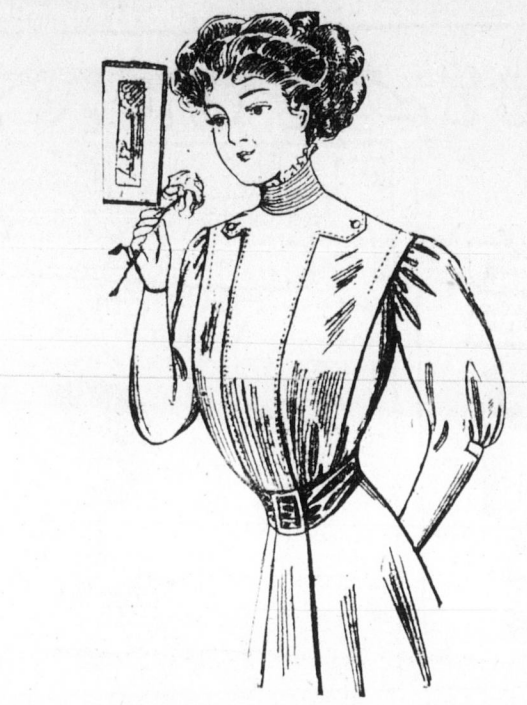
A SIMPLE BUT EFFECTIVE STYLE

edge develops an absolutely new idea respecting the stole. The turban and the stole are allied.