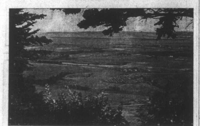
Canada's "Atlantic" Province—The above photograph, taken from a prominence locally known as "The Lookoff", gives a splendid view of the fertile Cornwallis valley, Nova Scotia. This and the Annapolis valley form the centre of the fruit-growing industry in this province.