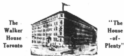
The Walker House Toronto