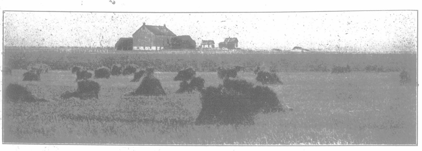
A Great Country Nearer Hand

Do not forget that both great regions have their difficulties. If you think you can escape them by settling on the Prairie you may be sadly mistaken, especially if you have no capital. The difficulties are sometimes very great, and the ov erstrained man suc cumbs. He says bitter things about