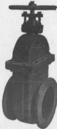
Flanged End Gate Valve with Hand-Wheel.