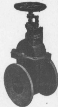
Indicator Gate Valve.

Railway Supplies, Structural and Ornamental Iron Work