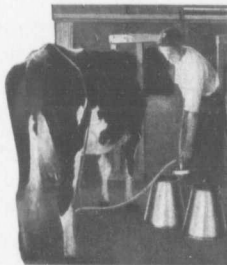
The Hinman has the rapid pull-change idea