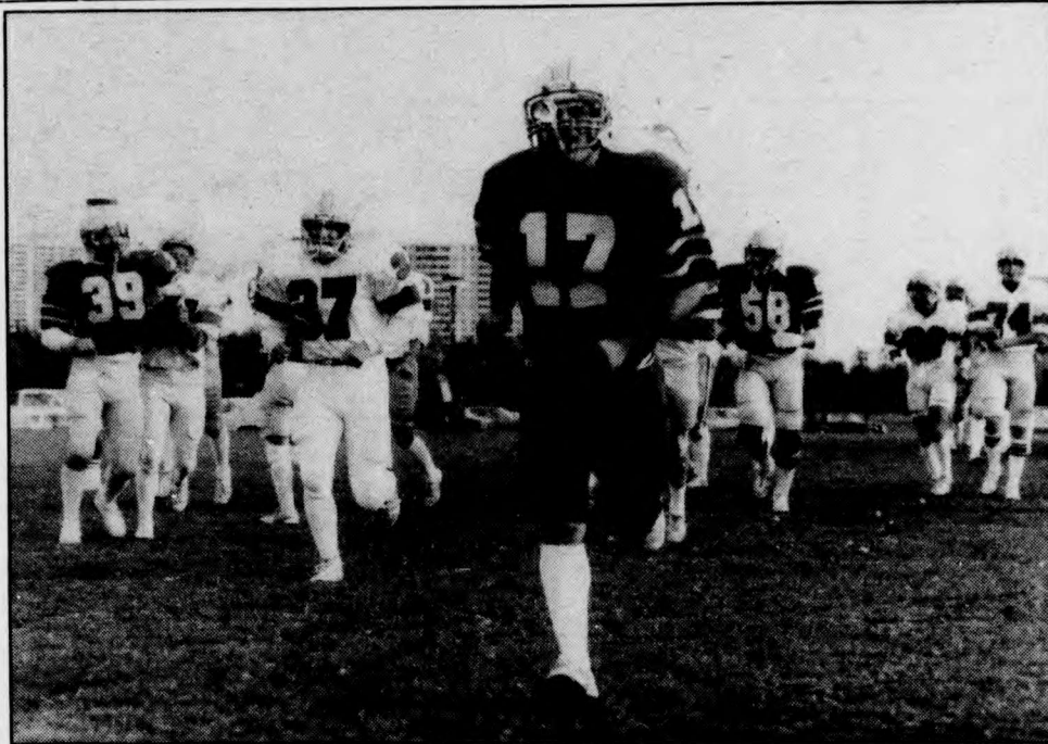
ON THEIR WAY: York Yeomen are tied for first place after strongest start in team's history.