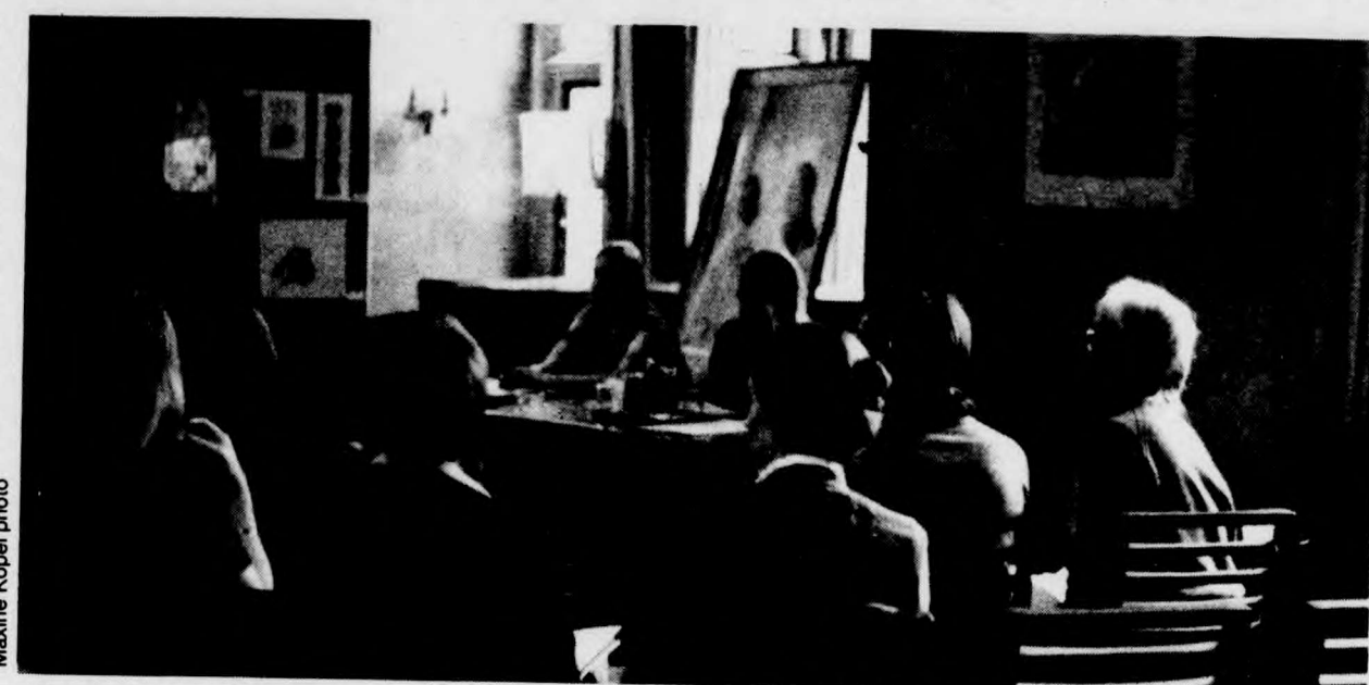
Women from universities and colleges across Canada gathered at Hart House last weekend to discuss academic and social issues.

Some universities feel that women's studies are not necessary, according to Homemaker's Magazine. Some people view the educational process as an excellent opportunity for men to better them-